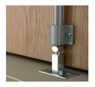
Bottom shoot with standard easy clean socket