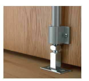
Bottom shoot with flat plate