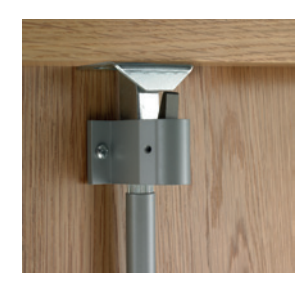
Top shoot with standard top trip release