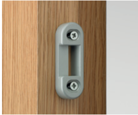
Universal keep - surface mounted