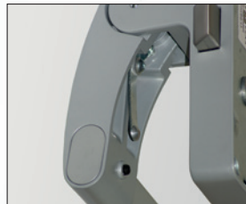
Optional Hold-Back function housed beneath arm of mechanism unit