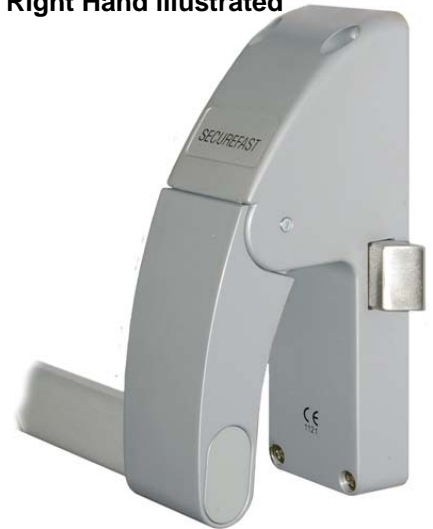
SED991/SE/RH Right Hand illustrated