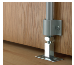
Bottom shoot with flat plate