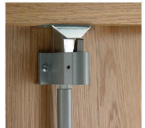
Top shoot with standard top trip release