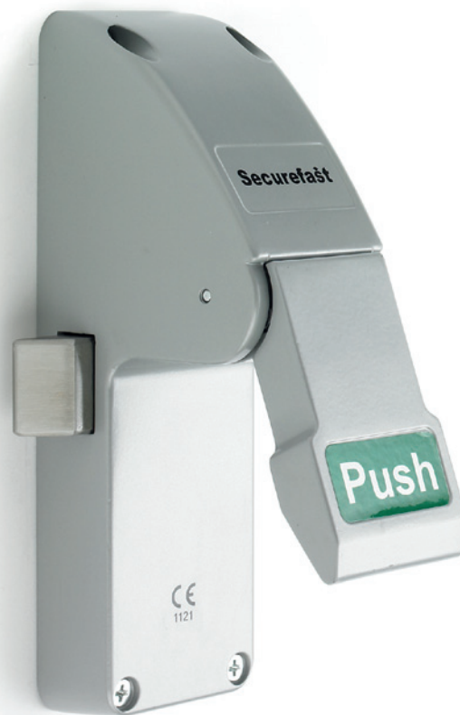
Universal keep - surface mounted

SE Powder coated silver (as standard) SC Satin Chrome plated