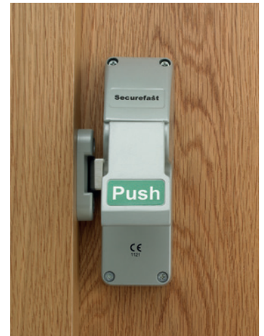
Optional Hold-Back function housed below arm of mechanism unit