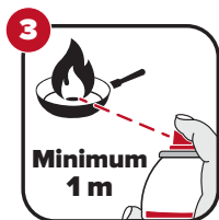
AIM AT BASE OF FIRE