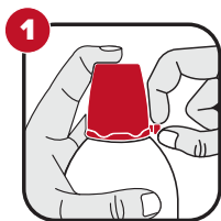
PULL TAB ON CAP

EXTINGUISHES COMMON HOUSEHOLD FIRES FROM GREASE, WOOD, PAPER AND HOUSEHOLD WASTE.