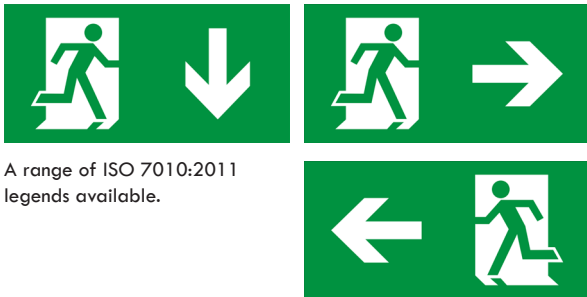
A range of ISO 7010:2011 legends available.

The X-ESS Light a wall mounted, LED emergency escape route sign. Sleek and stylish in design with a convex front and perforated downlight. Including a self-testing feature to ensure that routine monthly and yearly tests are never missed.