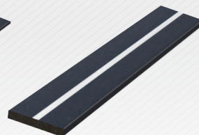
Fire Rated Packer 3mm x 15mm x 100mm White