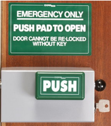
101 - Non-Alarm Bolt