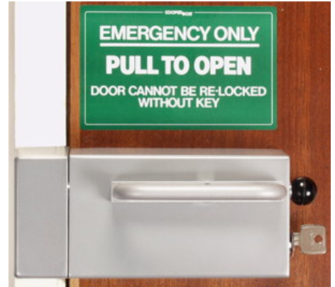
102 - Non-Alarm Bolt