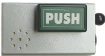
103 - Alarm Bolt