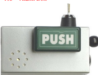
103S - Alarm Bolt with Switch