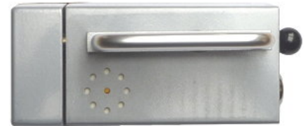
104 - Alarm Bolt