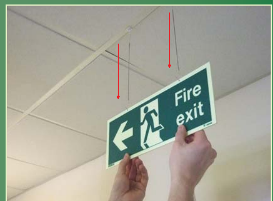
Allows for adjustment dependant on environment.