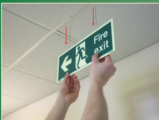
Spring loaded Ceiling hooks allow height adjustment.