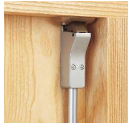
Optional pullman latches