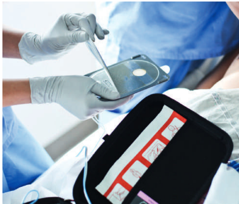
The HeartStart FR3 is small and light, which makes it easy to carry and maneuver in tight places.