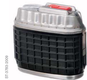
Dräger Oxyboks K 25