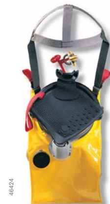
Dräger Oxyboks K 25 opened