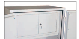
Optional Coffers** (FS1512/13/14 only)