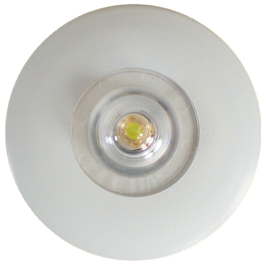
Standard Recess Option