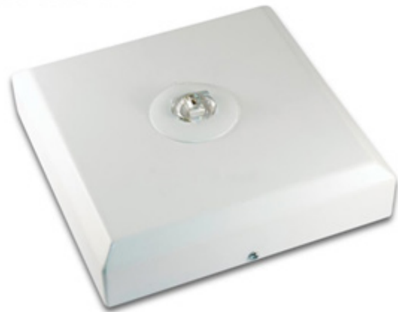
Surface Mount Option