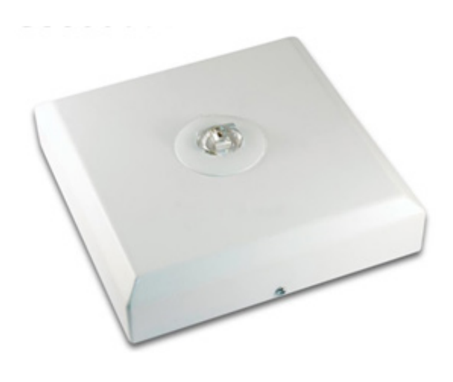
Surface Mount Option