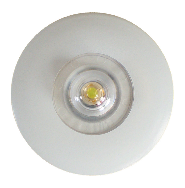
Standard Recess Option