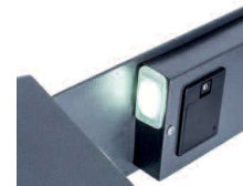
LED INTERNAL LIGHT (E LOCK VERSION ONLY)