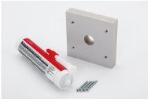
11345 - Fireproof cable entry