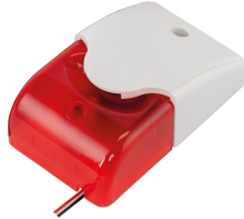
11389 - Combination alarm unit, visual and audible alarm (100dB)