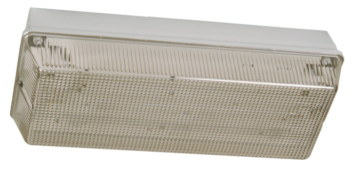
JP - Square prismatic diffuser