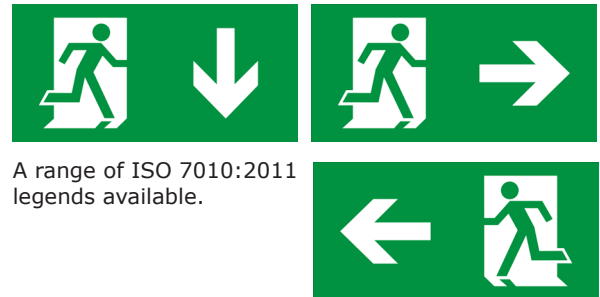
A range of ISO 7010:2011 legends available.