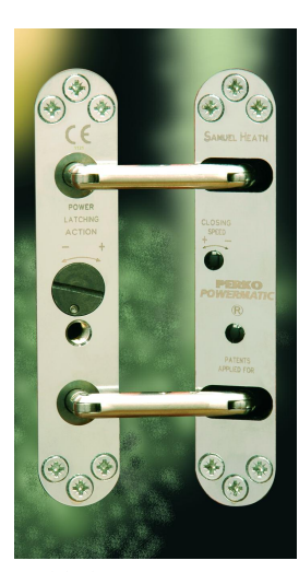
R100.CP Chrome plated