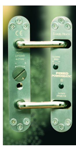
R100.SCP Satin chrome plated